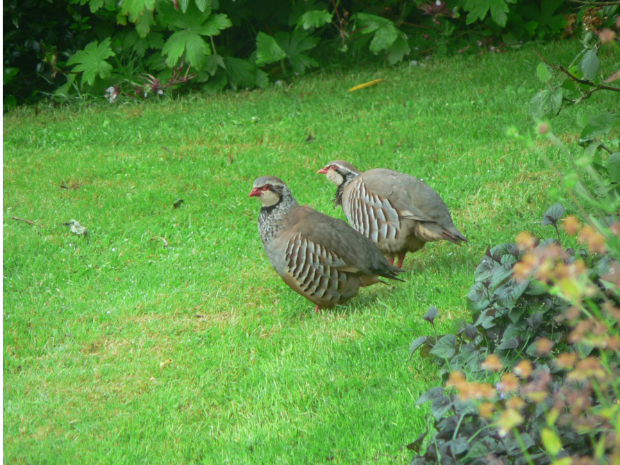
Red-legged Partridges, Clochan 28 June 2008 (Martin Cook)