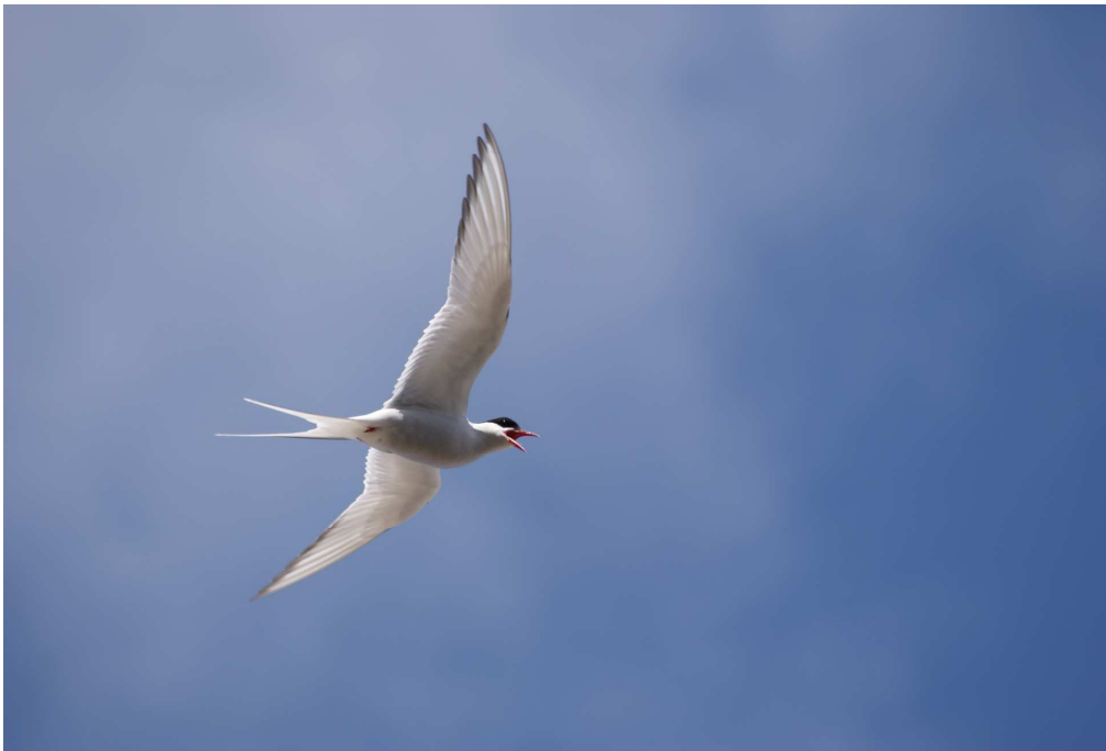
Arctic Tern, near Lossiemouth 29 June 2009

Last of the year, in early October, were 1 Lossiemouth 1 st , 7 Lossiemouth 3 rd , 1 Burghead Bay 4 th and 1 Lossiemouth 4 th .