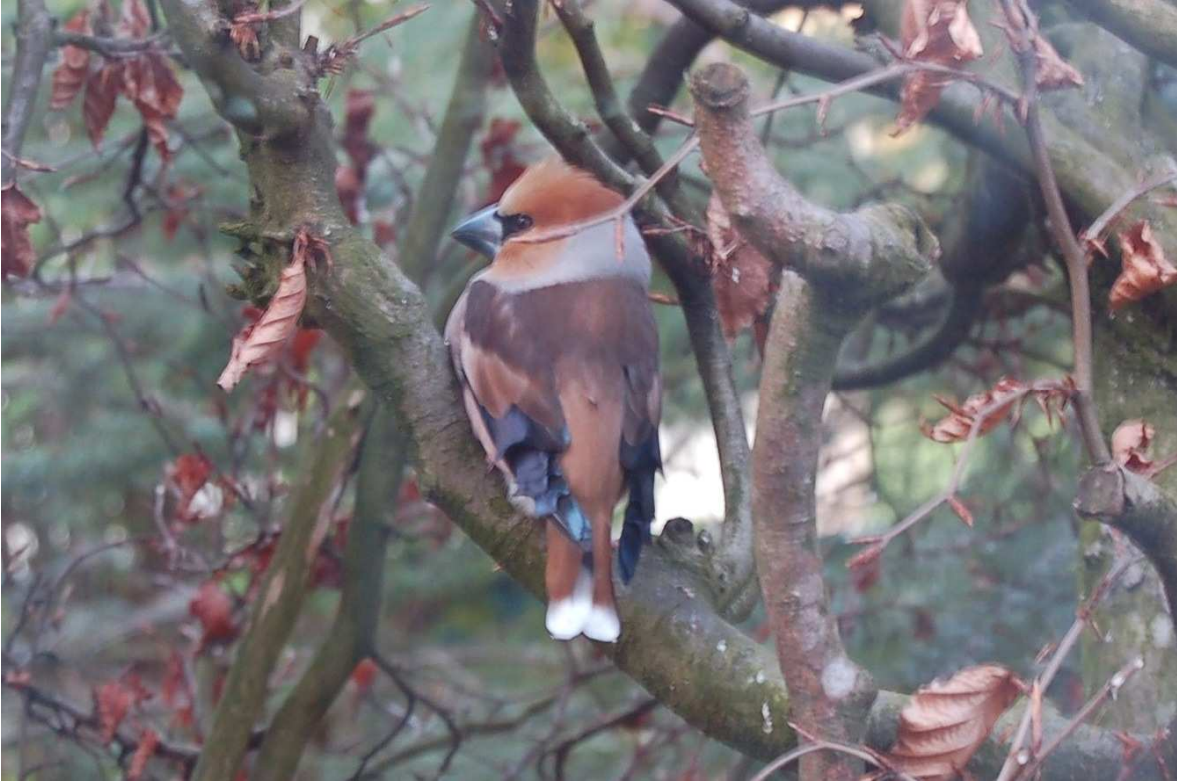
Hawfinch, Aberlour 29 April 2009