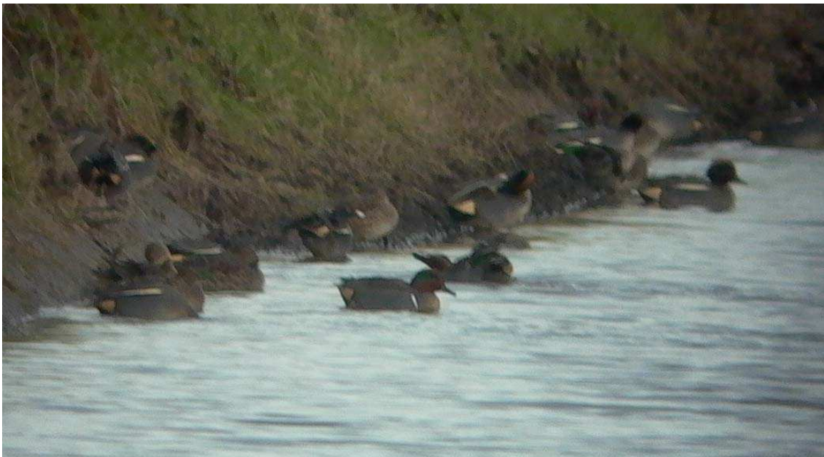
Green-winged Teal, Spynie canal 31 January 2009 (Duncan Gibson)

Spynie Canal/Gilston area: a male, first seen at Loch Spynie in Dec 2008, was relocated amongst a group of Teal on 31 Jan (DAG,RP) and remained in the area until 15 Feb, though elusive. In December a male was seen on 6 Dec (DAG,RP,WW-M) and again on 12 Dec (CAG).