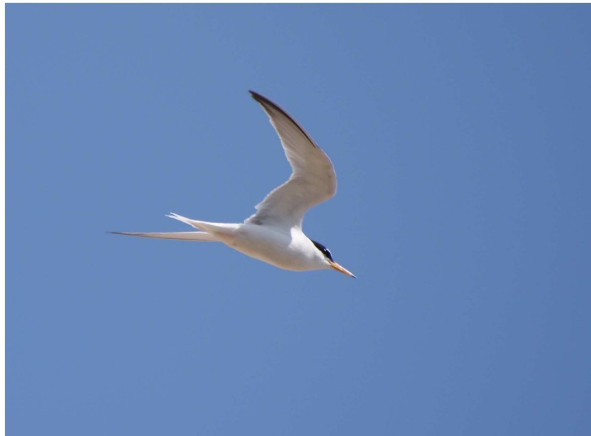
Little Tern, near Lossiemouth 29 June 2009 (Ian Francis)

Away from breeding sites, 2 Nairn Bar 1 Jun (DCJ).