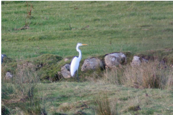
Great White Egret, Dallasbraughty 18 November 2009