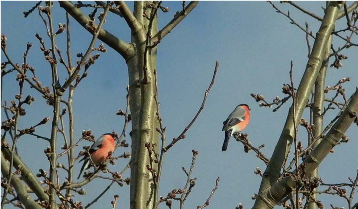
Northern Bullfinches, Aberlour 6 March 2005

Groups of local birds included 34 Culbin Forest 12 Feb, 22 Loch Allan (Dava) 19 Nov, 12 Loch Loy 5 Oct (7 there 15 Sep), 12 Loch Spynie 2 Apr, 12 Stonewells 29 Oct, 10 Innes estate 14 Sep, 7 Brodie Castle pond 21 Nov, 6 Elgin 28 Feb and 5 Newmill (Auldearn) 7 Mar.