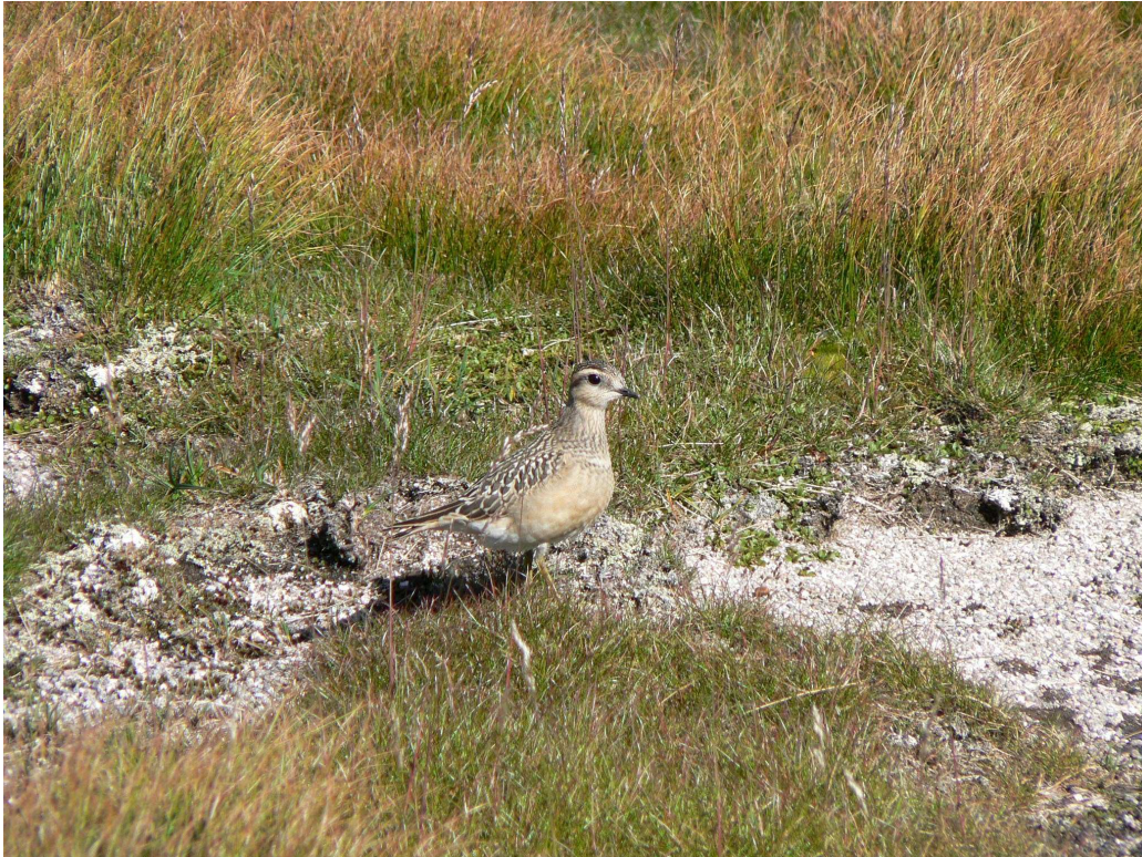
Dotterel (juvenile), Cairn Lochan 20 August 2005

1 Ben Macdui 16 Jun (IL). On the 29 Jun in the Cairngorm area a male was seen with 3 chicks (AJ). On the same day a female was seen in Coire Raibeirt with 3 others unseen calling nearby (AJ). In early July a pair with a brood of 1 was recorded in the Cairn Lochan area (DF). 1 fledged young was also recorded at Cairn Lochan ridge on 20 Aug (MJHC).