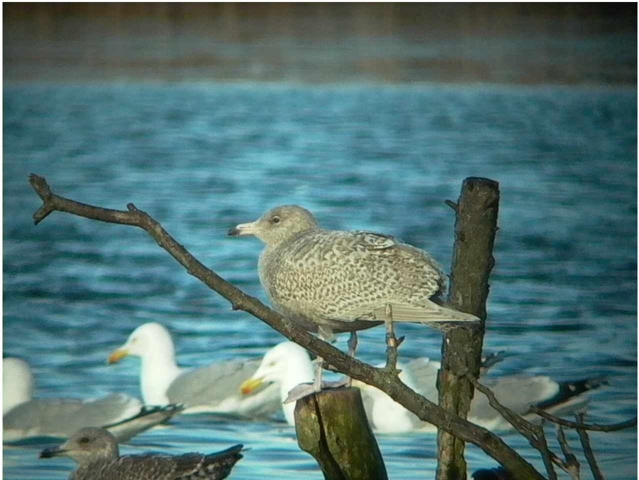
Glaucous Gull (1 st winter), Loch Spynie 6 March 2005

In the second winter period, 1 adult Cullen 21 Dec (Birdguides) probably relates to a returning bird. At the Lossie Estuary, 1 1 st winter on three dates between 13-26 Nov (AJ,DAG,JDHM), with 1 st winter birds at Burghead 26 Nov (Birdguides) and Tugnet 3 Dec (MJHC) perhaps relating to this bird. A 3 rd winter was at the Lossie Estuary on 18 Sep (DAG).