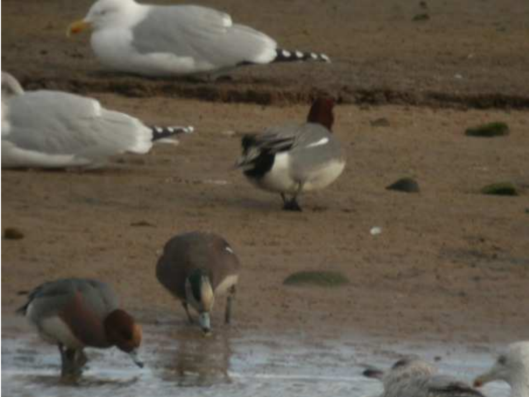
American Wigeon (adult male), Lossie estuary 22 January 2005