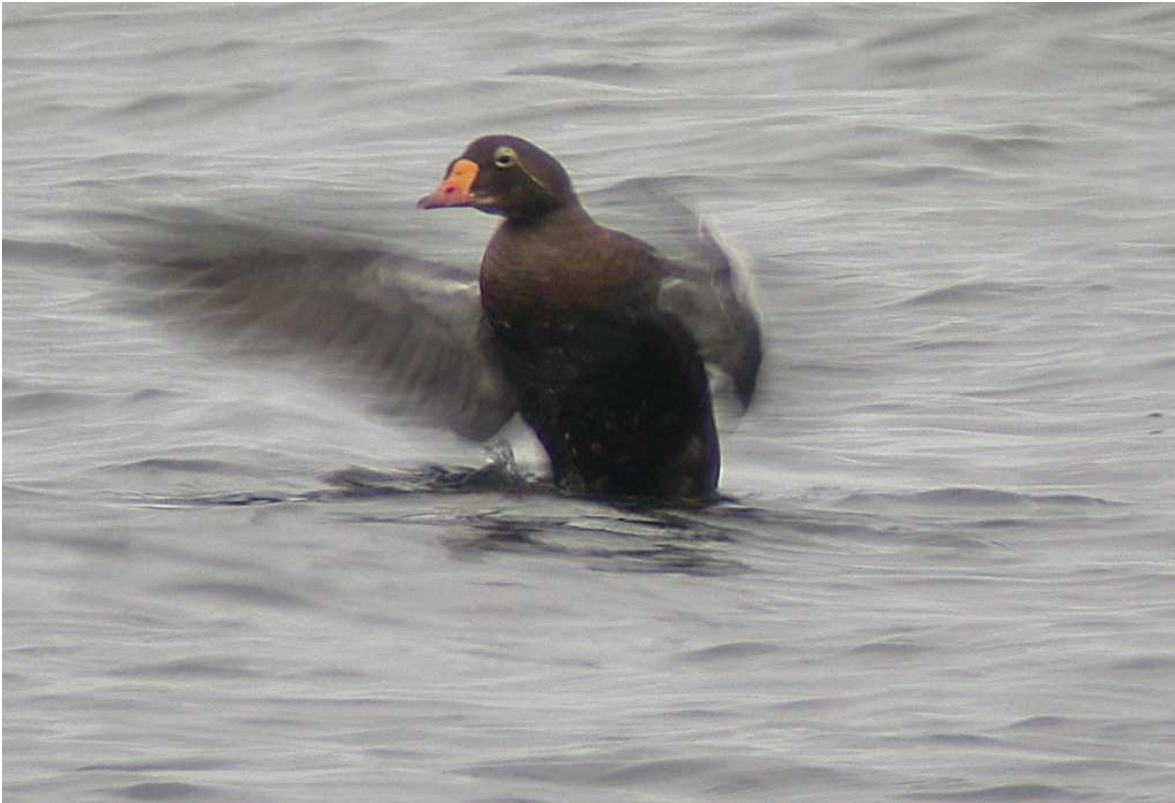
King Eider (eclipse male), Nairn 9 October 2005

A male, in eclipse plumage, was found off Nairn golf course on 24-27 Aug, and again from 2-11 Oct (MJHC,AJ,RP et al.). The last record for Moray & Nairn was in 2001 (relating to the long-staying male off Hopeman-Lossiemouth).