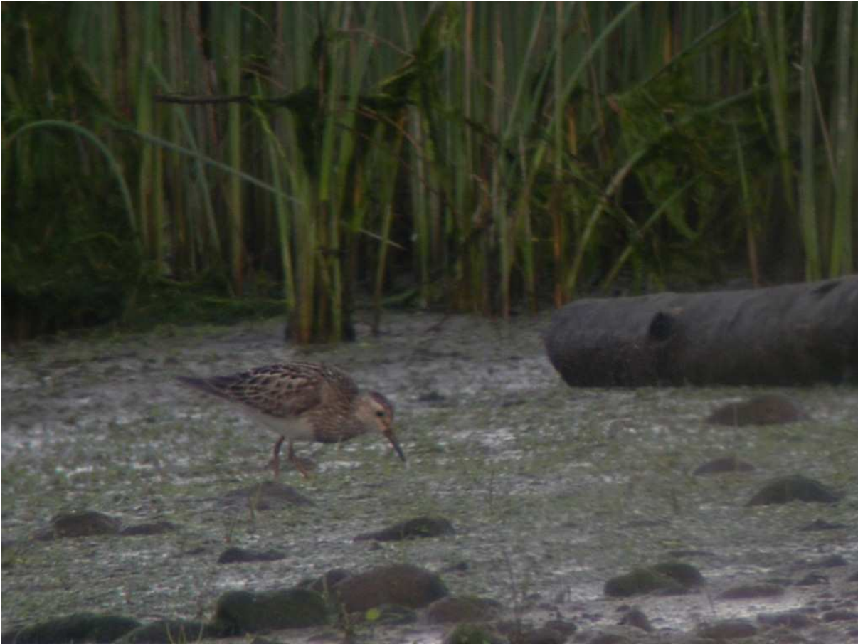
Pectoral Sandpiper, Kingston 11 July 2005