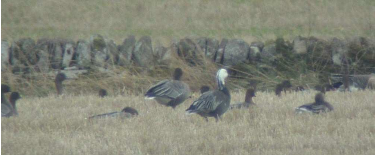
Snow Goose (blue morph), Coltfoot 4 October 2005

The first record of a blue morph Snow Goose occurred in the Miltonhill area when an adult was present from 27 Sep-11 Oct (RFH et al. ). Since 1967 records of white morph Snow Goose have occurred on 8 occasions (minimum of 13 birds), with the last occurrence in 1993.