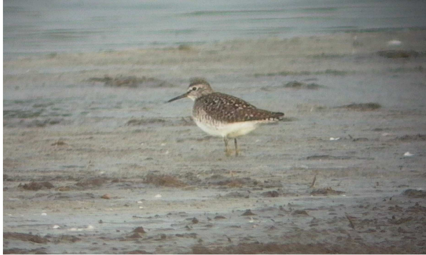
Wood Sandpiper, Miltonduff 12 May 2005