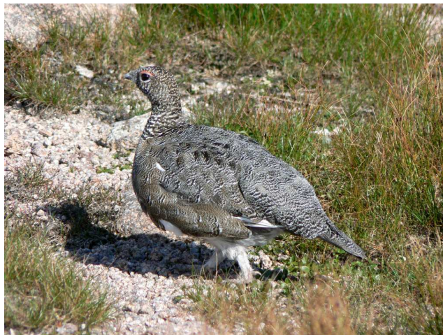
Ptarmigan, Cairn Gorm 20 August 2005