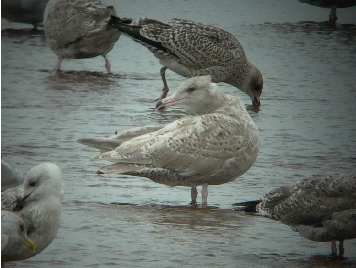
Glaucous Gull (2 nd winter), Lossiemouth 3 September 2005