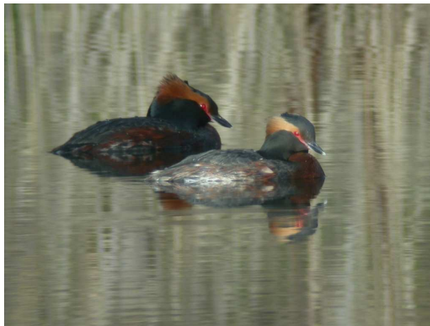
Slavonian Grebes, Moray 20 April 2004

Elsewhere, 2 Burghead-Cummingston 20 Oct (1 there 14 Jan), 2 Culbin Bar 8 Dec, 1 Nairn Bar 16 Oct and 1 Lossiemouth 9 Jan, 19 Mar and 14 Aug.