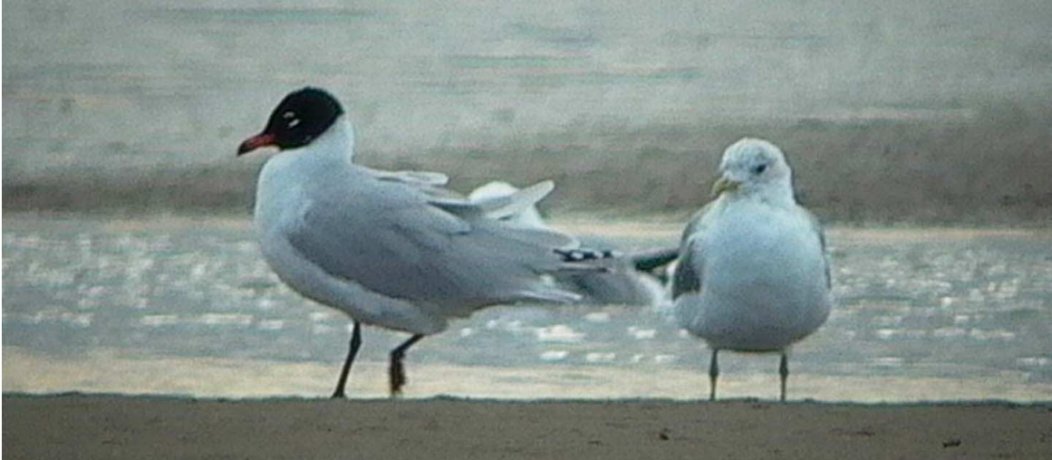
Mediterranean Gull (2 nd summer), Findhorn Bay 2 April 2005