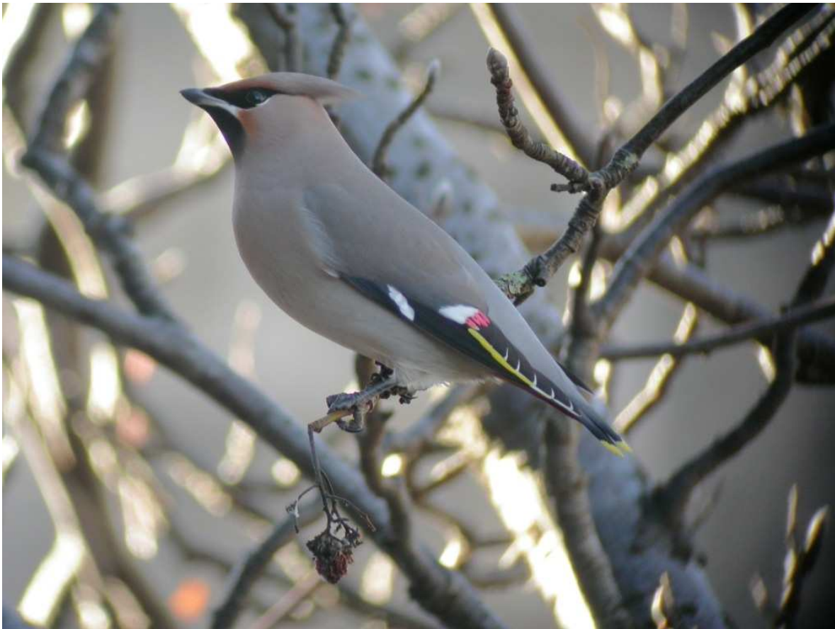
Waxwing, Moray 9 November 2005

Autumn-winter: A moderate influx from early November saw birds in 9 localities, with most in Elgin. Localities involved were Delmore (Aberlour): 8 on 28 Nov (AE). Dufftown: 4 on 25 Nov (WRPB). Elgin: In the railway station/South St. area in Nov were 17 on 7 th , 23 on 8 th , 26 on 10 th , 24 on 12 th , 20 on 14 th , 9 on 19 th , and 10 on 22 nd (AJ,PTH,EH,DAG,CAG, J.Darroch). At Linkwood, 5 on 11 Nov, 1 there 15 Nov and 6 on 6 Dec (RP). In the Cooper Park, 12 on 20 Dec (RM). Forres: 7 on 7 Dec, 8 on 13 Dec, 18 on 23 Dec, 10 on 30 Dec (J&HMcD,AJ, AJL,A.Craig). Hopeman: 3 on 5 Nov (PTH). Kinloss: 1 on 23 Nov (AJL). Loch Spynie: 1 on 6 Nov (JDL). Lossiemouth: 12 on 29 Nov, 5 on 27 Dec, 8 on 31 Dec (JDHM). Tanzie (Ben Aigan): 1-2 between 20-27 Nov (GG).