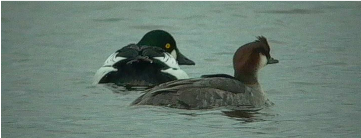
Smew 'redhead' with male Goldeneye, Loch Spynie 6 Apr 2003

Loch Spynie: A female was present 1 Jan – 12 Apr (RAM, DAG, et al. ).