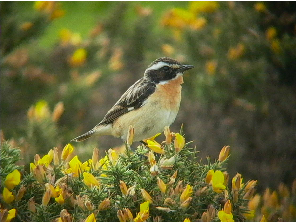
Whinchat male, Glenlatterach 14 June 2003

Another species benefitting from increased attention during Atlas fieldwork. Reports in breeding habitat came from Cairn Eney (2 pairs), Carn Meilich (Glenlivet), Culbin Forest (3 juvs on 9 Jul), Dinnyhorn (song), Glenlatterach (min. 2 pairs – 1 feeding young), Knockan (song), Lochbuie and Sandyhillock (song). More likely to have been a spring migrant was 1 Clashach Quarry (Covesea) 4 May (EH).