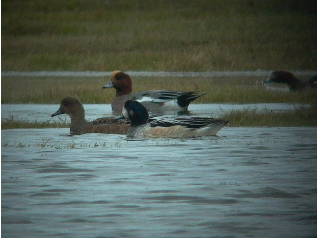
Chiloe Wigeon, Lossie estuary 26 Oct 2003

An adult male was present among the Wigeon flock at the Lossie estuary on 25-26 Oct (HF, CAG, DAG), it was photographed on the 26 th . It later moved to the Cloddach quarry between 23 Nov-13 Dec (DAG,MJHC).]