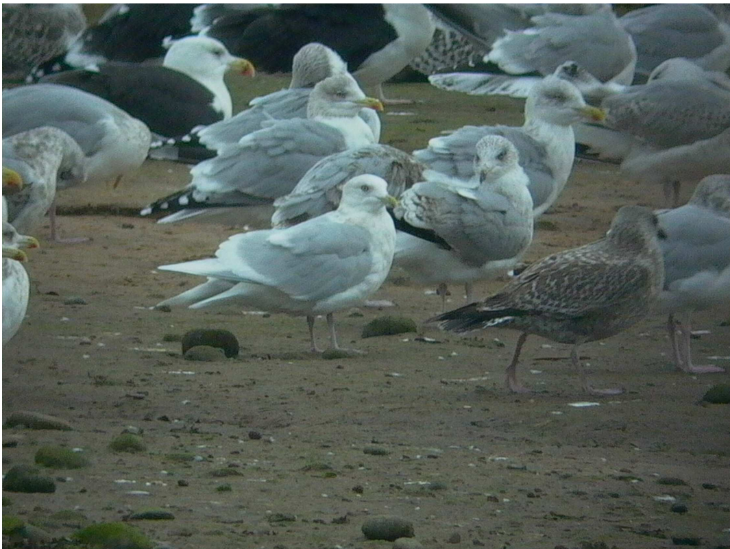
Iceland Gull adult, Lossie estuary 8 Nov 2003

Autumn-winter: 1 adult Lossie estuary 8-9 Nov (CAG) and 1 adult Loch Spynie 13-31 Dec (many obs.).