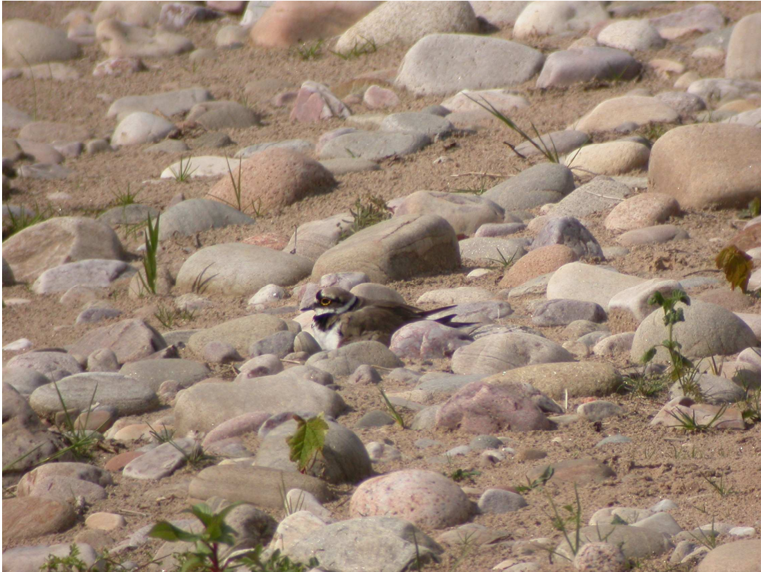
Little Ringed Plover on nest, River Spey at Garmouth 14 June 2003

In the Kingston/Garmouth area, one pair was first located on the estuary on 17 May (MJHC) and seen at a muddy pool in fields near Cunninghaugh on 30 May (HM). On 4 June a pair with a nest was found on the Spey shingles near the viaduct (MJHC). Two tiny chicks were seen on 22 June (DAG, HF) but the two adults were alone next day. On 14 June a second pair was located nearby but there was no evidence of breeding (MJHC, NH).