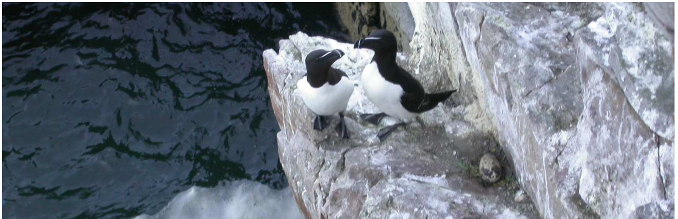
Razorbill pair with egg, Portknockie June 2003

Best offshore counts during the year were in early spring when 85 past Lossiemouth in 15 mins on 29 March (DAG) and on 1 Apr, 291 west past Burghead in 1 hour and 261 west past Lossiemouth, also in 1 hour (JDHM). Other counts of 30 or more through the year were 44 Nairn/Culbin Bars 16 Feb (and 109 there 12 Oct), 40 Burghead 27 Feb, 35 Findhorn 3 Apr, 33 Lossiemouth 10 Apr, 35 Strathlene 12 Apr, 180 Burghead Bay 8 Aug and 200 Findhorn 20 Sept (DMP).