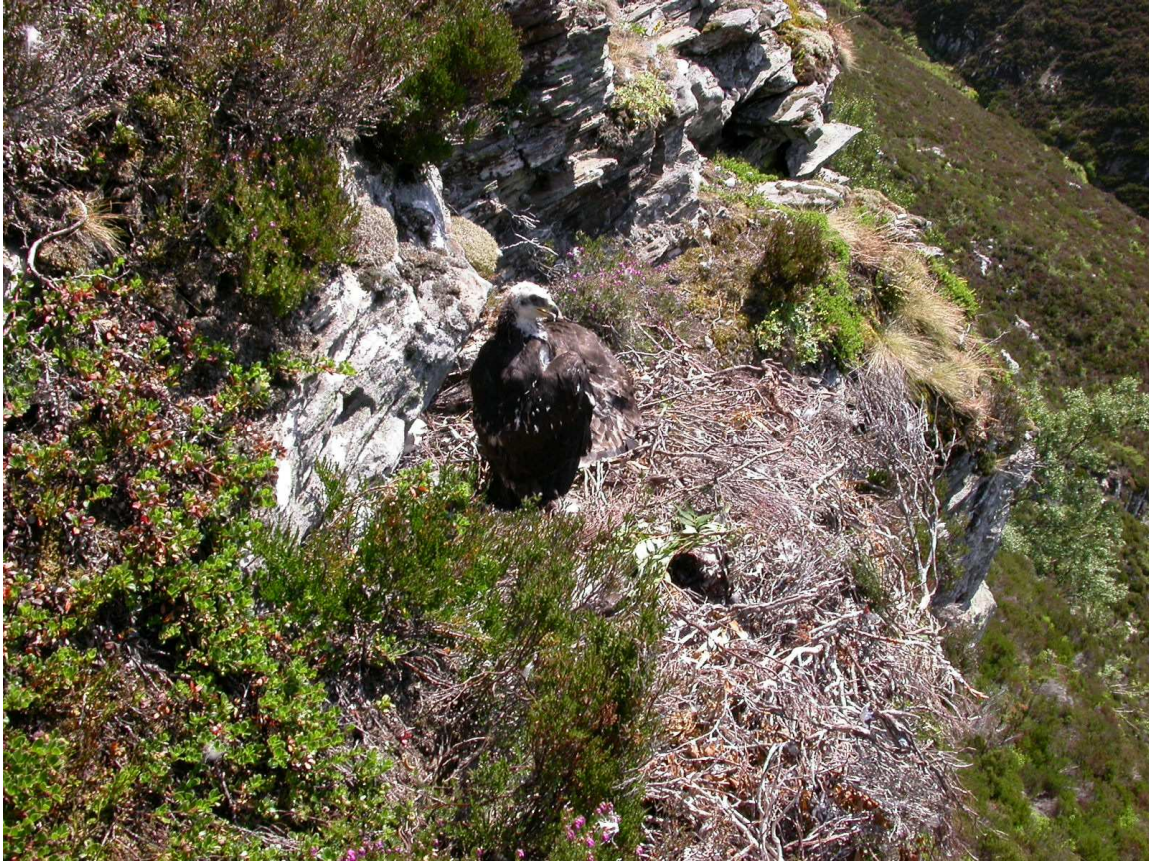
Golden Eagle chicks, Moray 29 June 2003