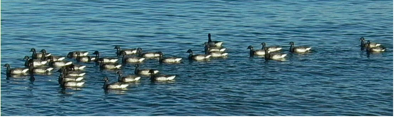
Brent Geese, Nairn 15 Feb 2003