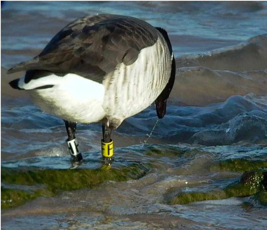
Brent Goose, Nairn 15 Feb 2003. The rings show that this bird was ringed in Denmark in April 2001 – see ringing section.