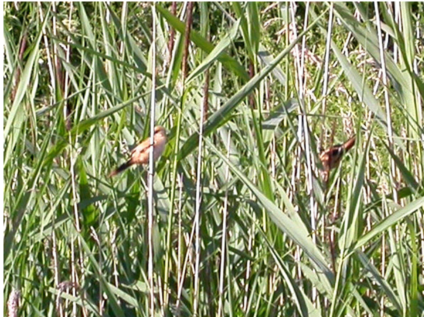
Bearded Tits, Loch Spynie 9 July 2003