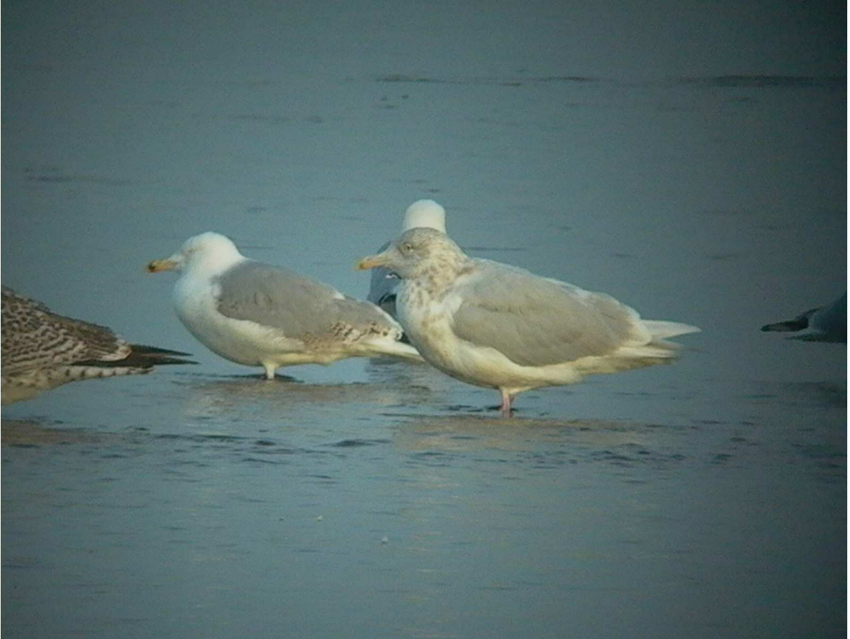
Glaucous Gull adult, Lossie estuary 16 March 2003

1 adult provided many records at Loch Spynie and nearby Lossie estuary 19 Jan-30 Apr (many obs.). Other records were 1 1 st winter Hill of Spynie pig farm 10 Jan (NH), 1 2 nd summer Portknockie 23 Apr (EH) and, near Spey Bay, 1 following a plough 8 Feb (WRPB) and it or another there 23 May (IF).